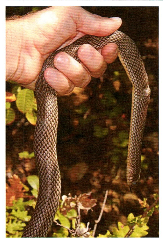
Picture 1: Caspian Whip Snake individual with wounded neck, using a burrow right in the middle of the track of bikers.