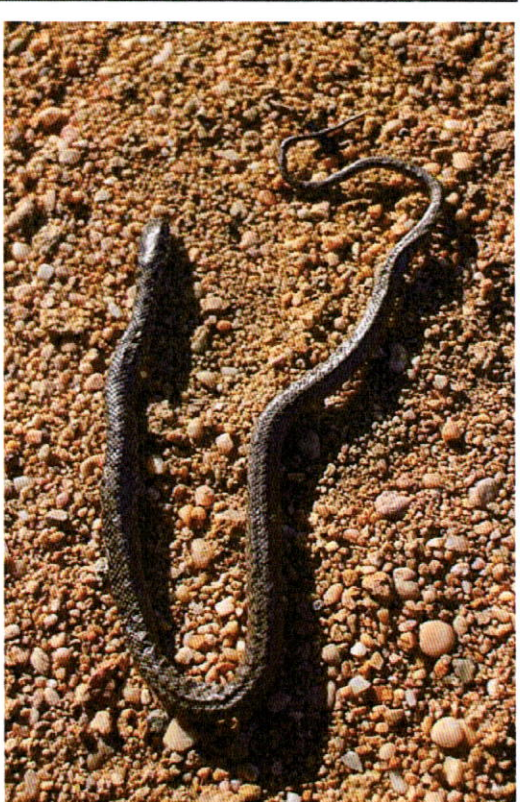
Picture 2: Road killed, freshly hatched specimen, found on the track of bikers.